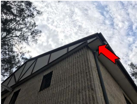
Photo 3. Exterior, east elevation, gable ends and eaves – non-friable asbestos-containing fibre cement sheeting.