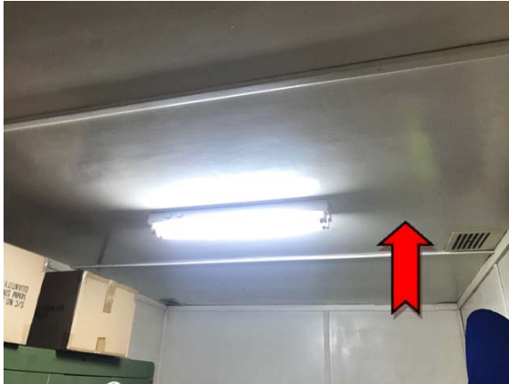
Photo 1. Interior, level 1, bathrooms, storage rooms and kitchen, ceiling – non-friable asbestos-containing fibre cement sheeting.