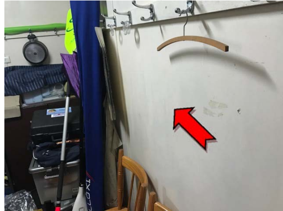
Photo 2. Interior, level 1, bathrooms, storage rooms and kitchen, wall – non-friable asbestos-containing fibre cement sheeting.